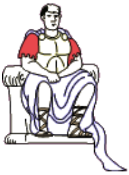
Decree from Artaxerxes